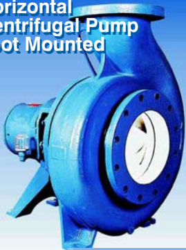
Horizontal Centrifugal Pump Foot Mounted