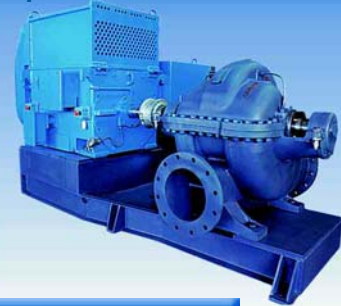
Horizontal Split Case