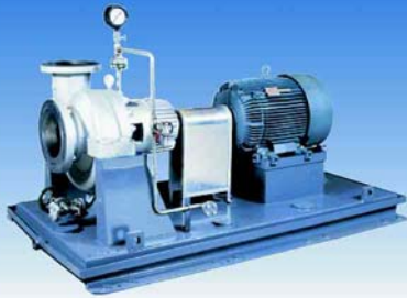
API 610 Overhung Radial Split